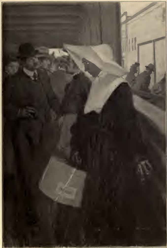
"He's a slick one, we hear, and may be working a stunt in disguise."